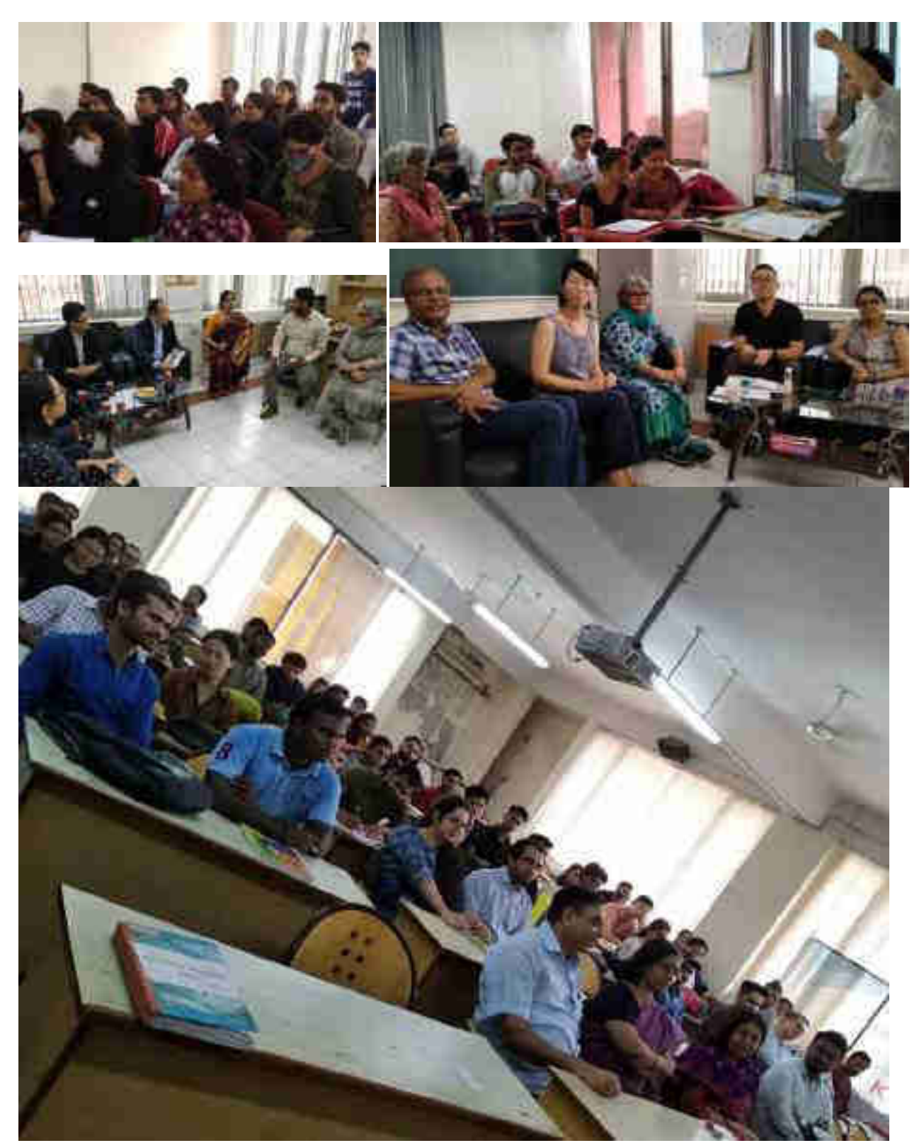
Above are some of the highlight sofour Department's Academic Activities with experts from abroad & India and the source of the highlight sofour Department's Academic Activities with experts from a broad & India and the source of the highlight sofour Department's Academic Activities with experts from a broad & India and the source of the highlight sofour Department's Academic Activities with experts from a broad & India and the source of the highlight sofour Department's Academic Activities with experts from a broad & India and the source of the highlight sofour Department's Academic Activities with experts from a broad & India and the source of the highlight sofour Department's Academic Activities with experts from a broad & India and the source of the highlight sofour Department's Academic Activities with experts from a broad & India and the source of the highlight sofour Department's Academic Activities with experts from a broad & India and the source of the highlight sofour Department's Academic Activities with experts from a broad & India and the source of the highlight sofour Department's Academic Activities with experts from a broad & India and the source of the highlight sofour Department's Academic Activities with experts from a broad & India and the source of the highlight sofour Department's Academic Activities with experts from a broad & India and the source of the highlight sofour Department's Academic Activities with experts from a broad & India and the source of the highlight sofour Department's Academic Activities with experts from a broad & India and the source of the highlight sofour Department's Academic Activities with experts from a broad & India and the source of the highlight sofour Department's Academic Activities with experts from a broad & India and the source of the highlight so four Department's Academic Activities with experts from a broad & India and the source of the highlight so four Department's Academic Academic Activities with experts from a broad & India and the source of th