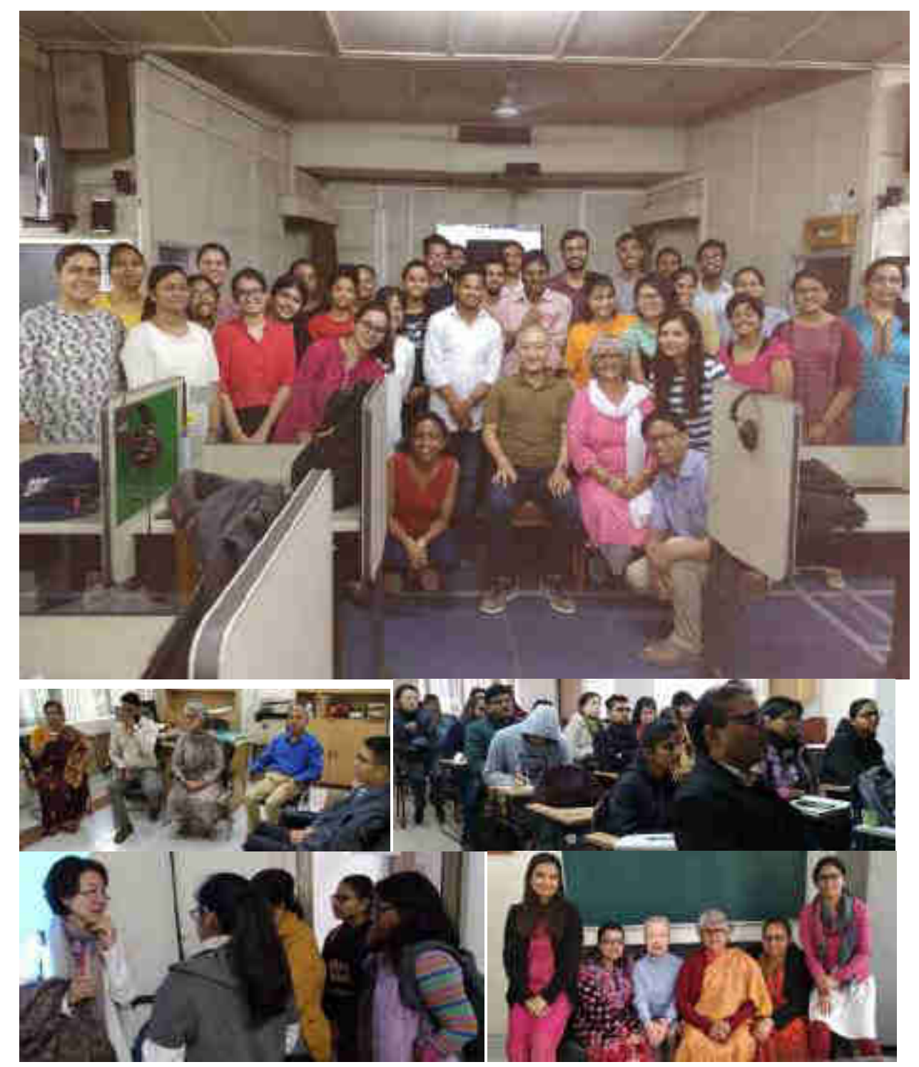
VisitingProfessors, Experts&DignitariesonChina, Japan&Koreaareinteractingwithourstudents