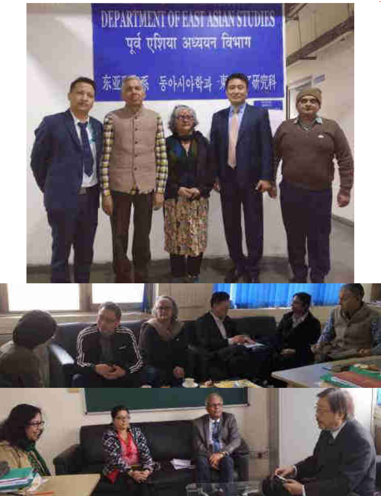
Meetingdelegates, interactions with experts from china Japan Korea