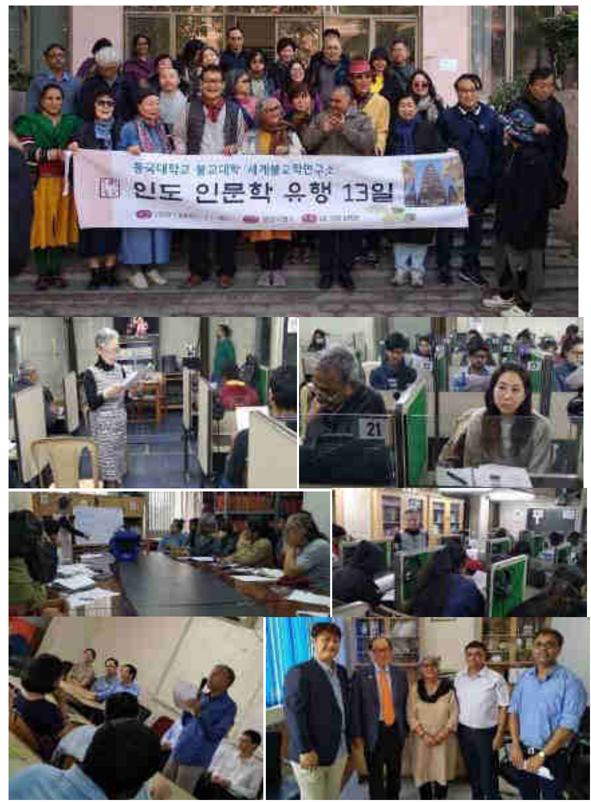
These are some of the highlights of our Lecture series, Seminars & Academic Activities