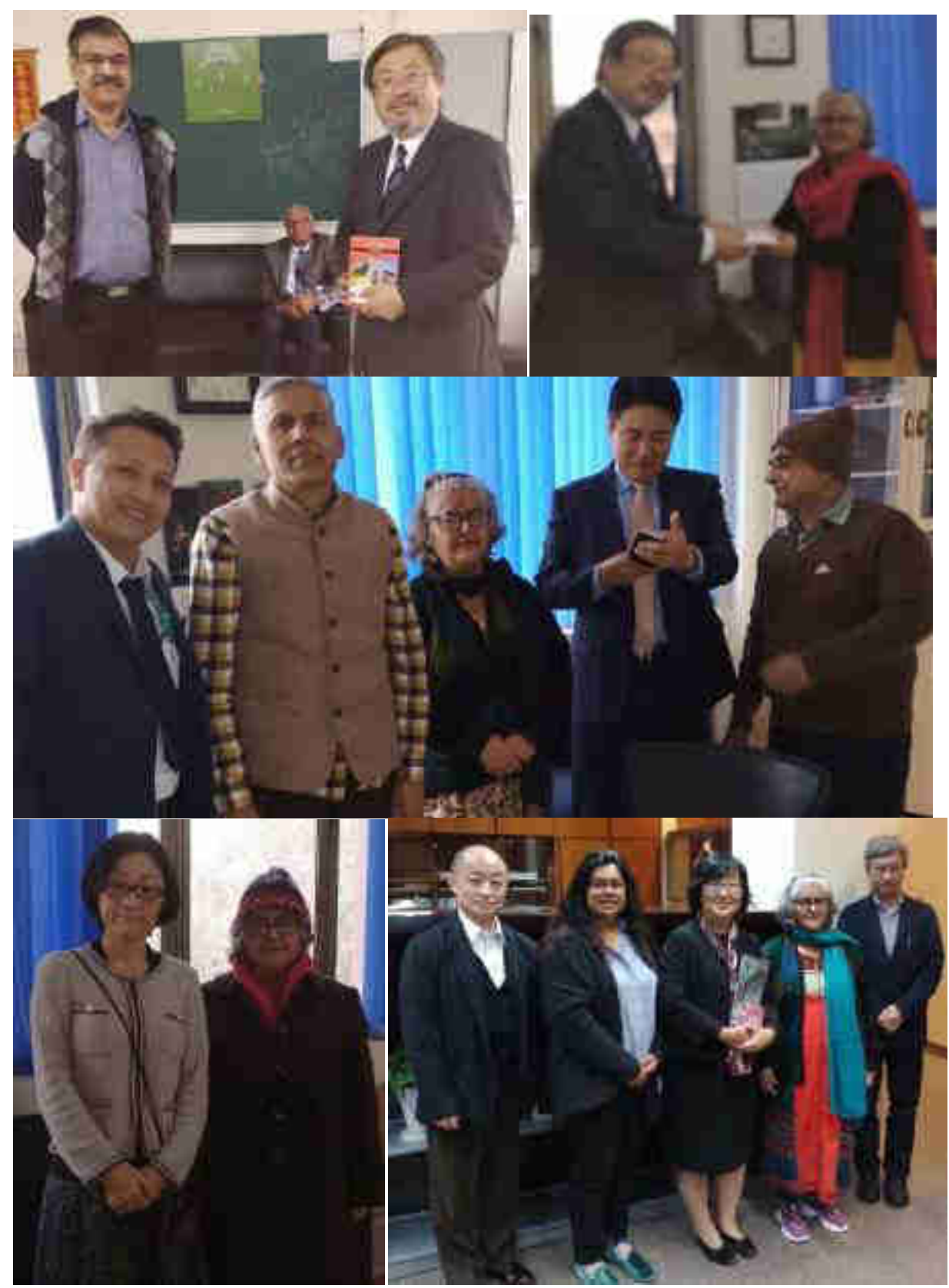
Meeting delegates, interactions with experts from China Japan Korea